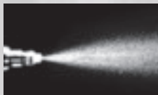
Injector spray pattern after P.i.® treatment

Optimal spray patterns ensure maximum engine efficiency, power and fuel economy.