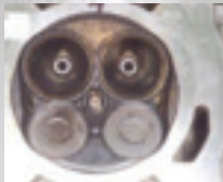
Combustion chamber before P.i.® treatment