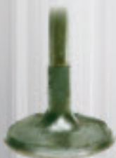
Intake valve after P.i.® treatment

Clean intake valves support maximum engine power, reduced emissions, proper engine efficiency and reduce the risk of valve failure.