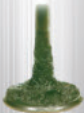
Intake valve before P.i.® treatment