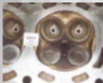
Combustion chamber after P.i.® treatment

Clean combustion chambers control knock, restore power and increase fuel economy.